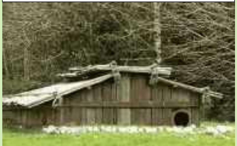
Traditional Plank House from the Yurok Tribe

Standard: 4.2 Students describe the social, political, cultural, and economic life and interactions among people of California from the pre-Columbian societies to the Spanish mission and Mexican rancho periods.